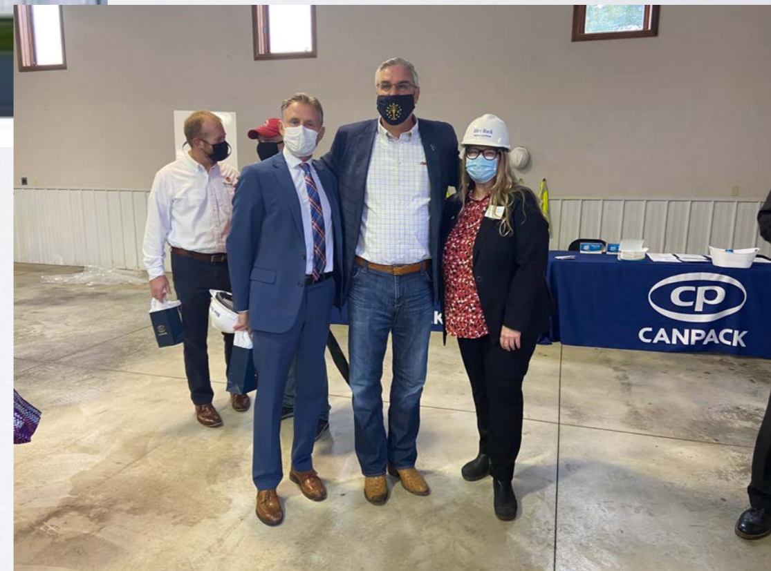
Governor visited for groundbreaking